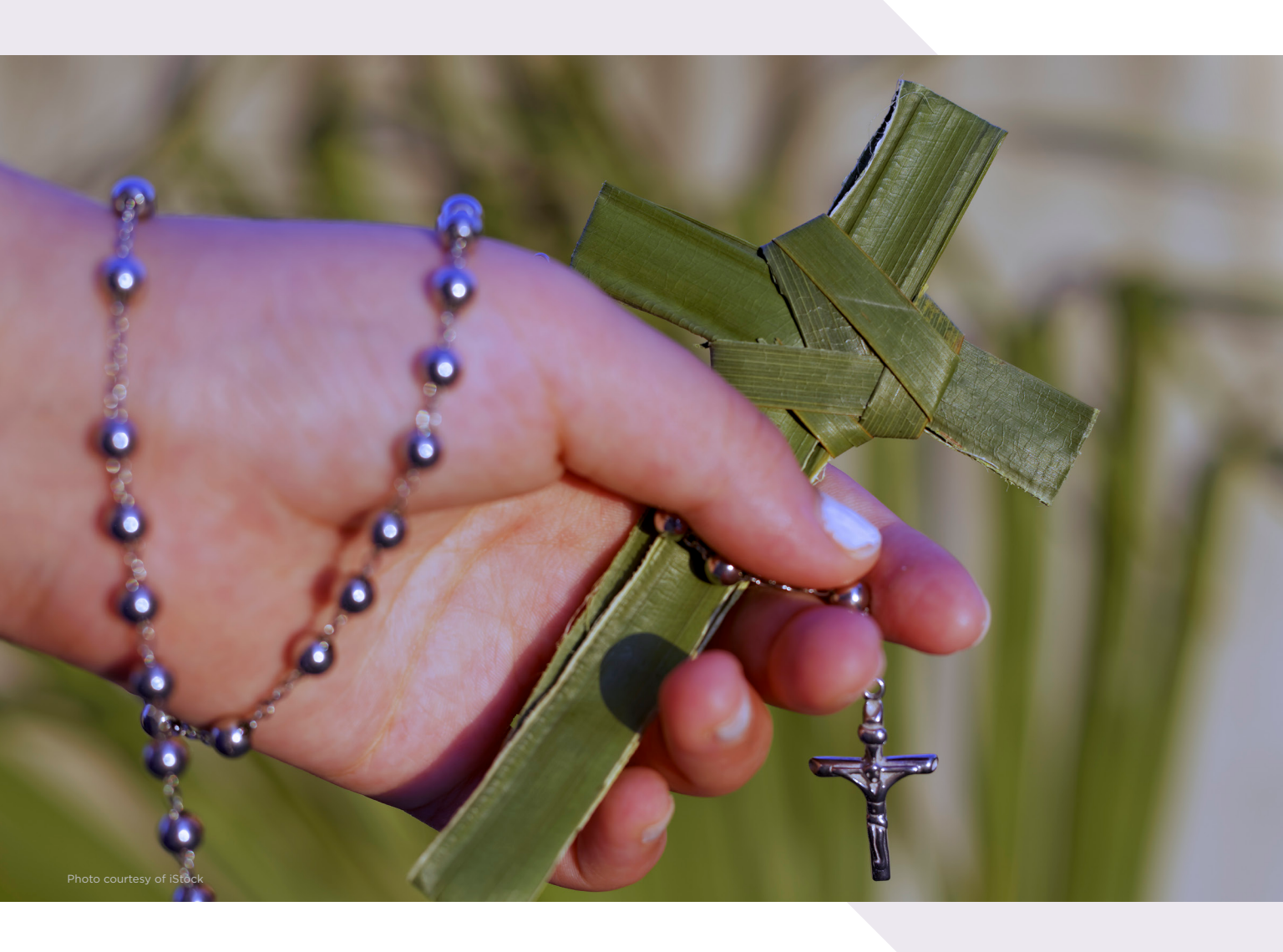
Encounter ourselves. Encounter our neighbors.