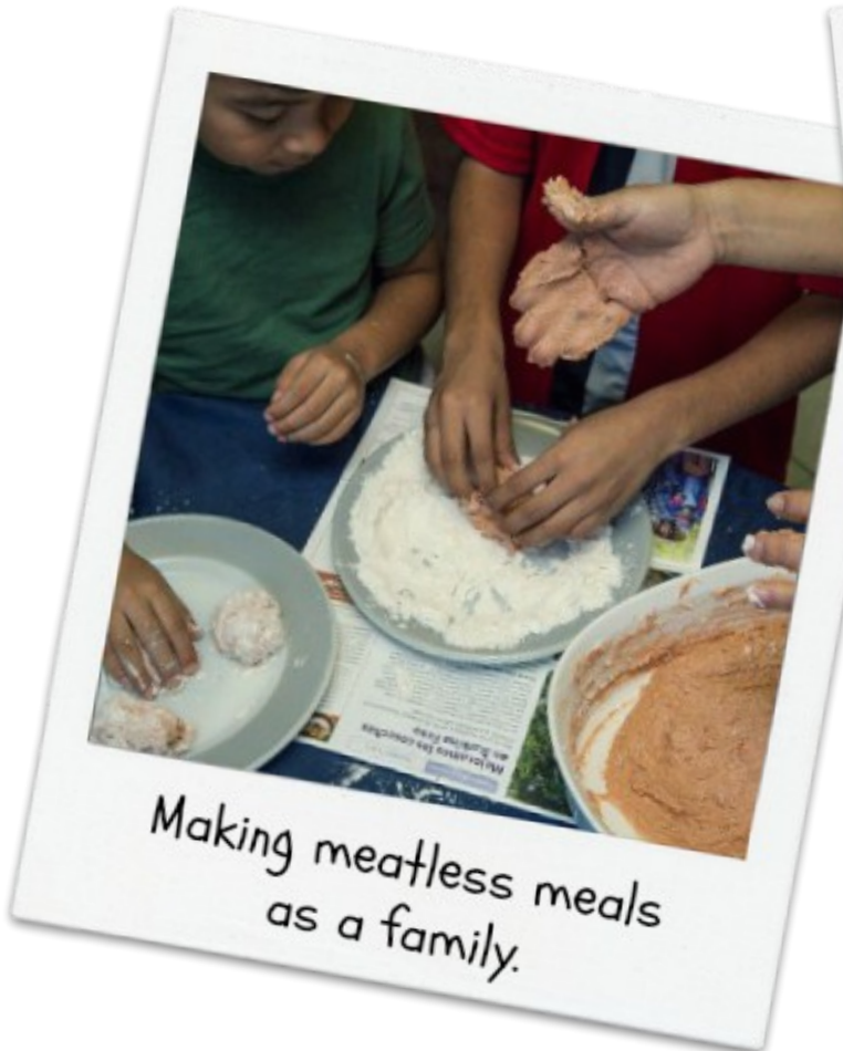
Making meatless meals as a family.