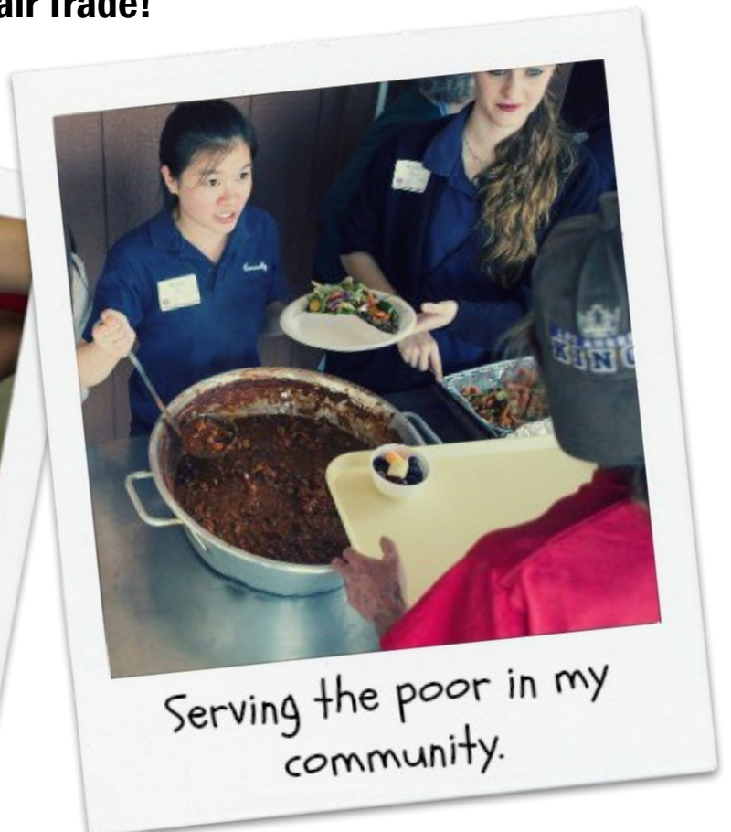
Serving the poor in my community.

By entering, you agree to the Terms and Conditions.